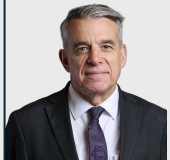
Jeff Smith MP Labour MP Manchester Withington Government Whip, Lord Commissioner of HM Treasury

RIPE's proactive, evidence-based work is essential to ensure these therapies can actually be delivered through the NHS, fulfilling their promise for patients."